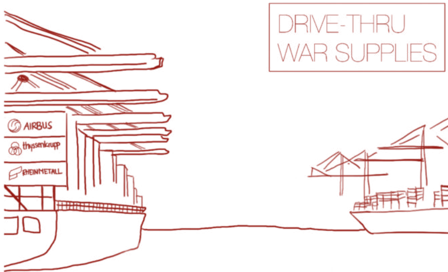
Port of Hamburg

All these goods pass through various points of imperialist geography on their way to Gaza, with one of the key hubs being only a stone's throw from us—the Port of Hamburg. As Germany's largest port, it plays a critical role not only in the country's civilian exports but also in arms exports.